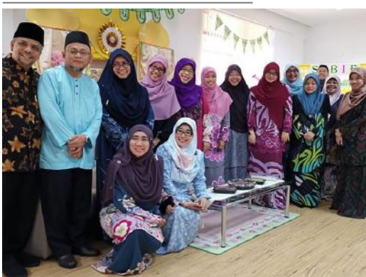
Hari Raya Aidilfitri