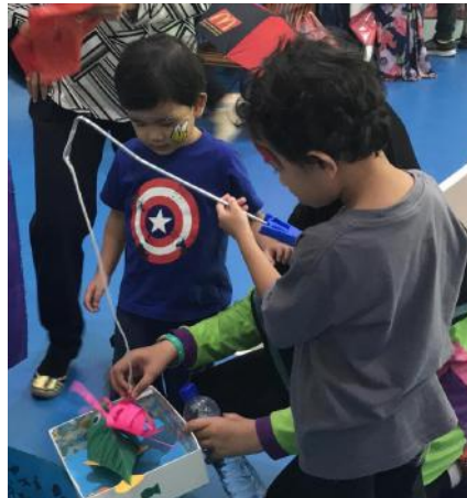
Lets shop and Save