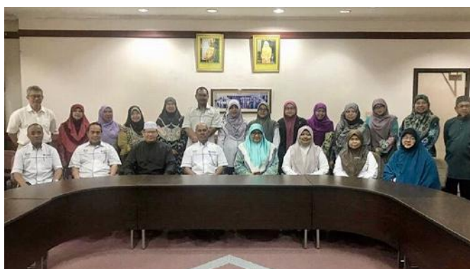
Photo of visitors from Institute Raya Campus Teacher Education Seremban

The second visit was from Institute Raya Campus Teacher Education Seremban, Negeri Sembilan, Malaysia on 28th October 2019. The visit consisted of 14 lecturers from Education Department.