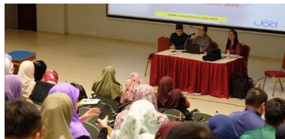
PL ITP and SP delivered talk during Mentor and Teacher Candidate Briefing