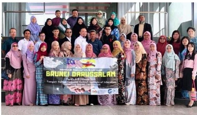
Photo of visitors from Institute of Education, Campus Ipoh and Sarawak

SHBIE hosted visits from two universities around the Southeast Asia region.