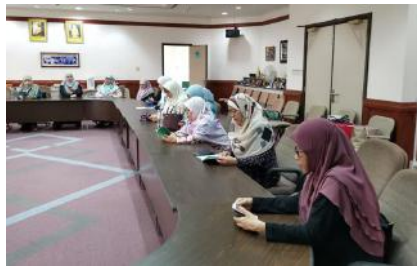
Weekly Tahlil Activity (Every Thursday) among lecturers and students