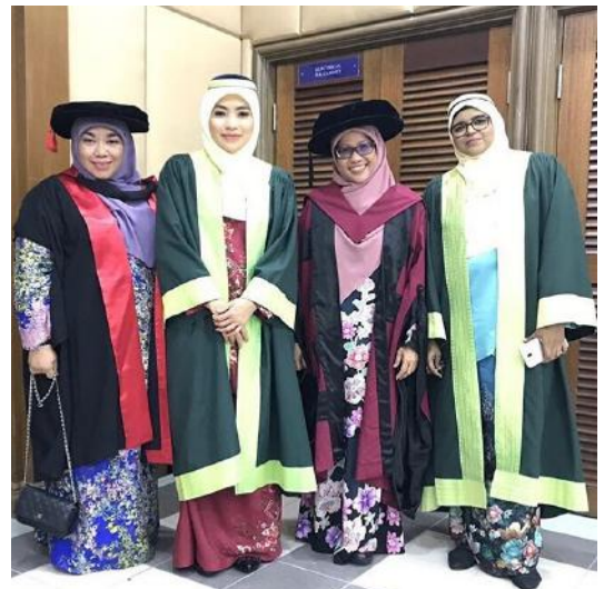
Lecturers and PhD Graduates

UBD 31st Convocation was held on 22nd August 2019 at Chancellor Hall, Universiti Brunei Darussalam. There were a total of 95 graduates from Sultan Hassanal Bolkiah Institute of Education. A total of 6 graduates from Doctor of Philosophy in Education, 14 graduates from Master of Education, 12 graduates from Master of Counselling and 63 graduates from Master of Teaching.