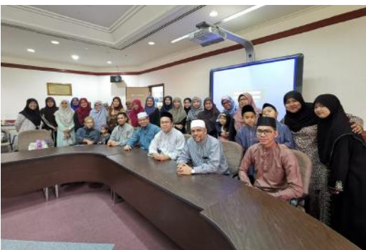
Maulud Nabi Muhammad SAW Event