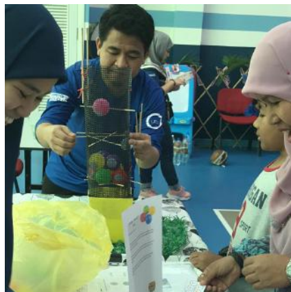
Ball and Stick