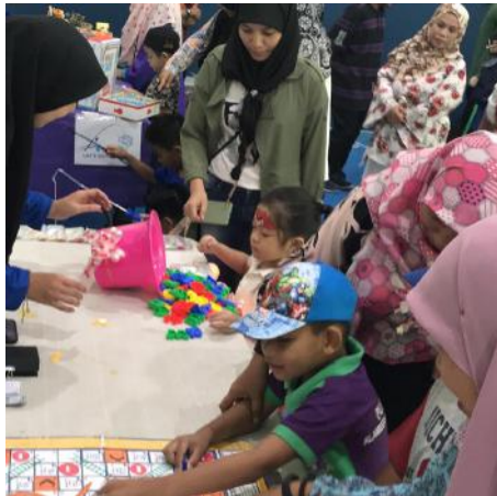
Snake ladder and Find me