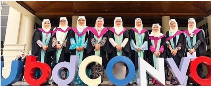
Master in Education and Master of Teaching graduates