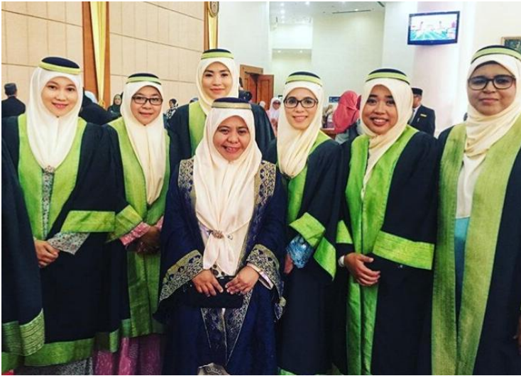
Dean, Sultan Hassanal Bolkiah Institute of Education and PhD Graduates